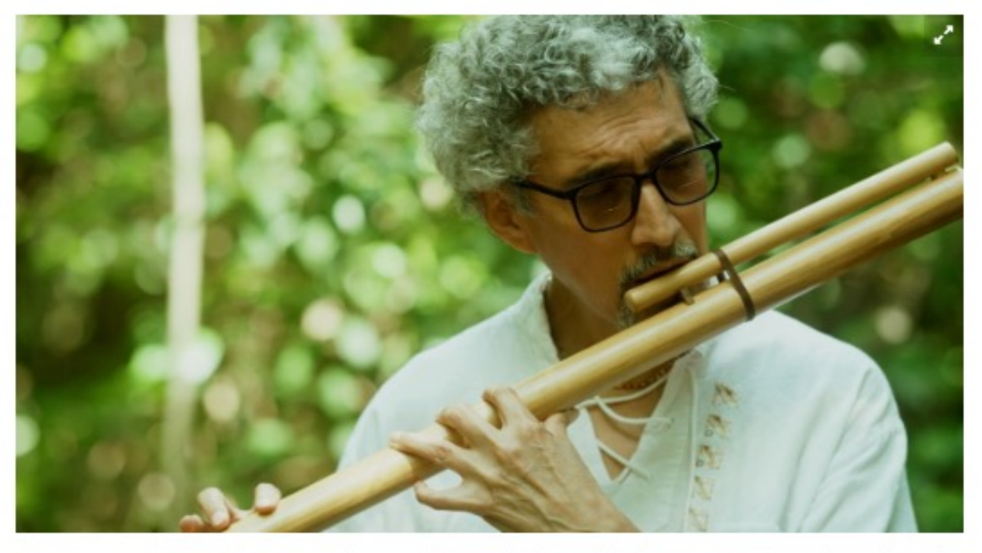
Afro Roots Fest features performances of the 'Everglades Songbook Suite,' blending acoustic stylings and natural sounds recorded in the park.

FLORIDA KEYS — Audiences can celebrate world music in the Florida Keys during the annual Afro Roots Fest, whose 2022 season includes multiartist showcases in Key West and Islamorada.